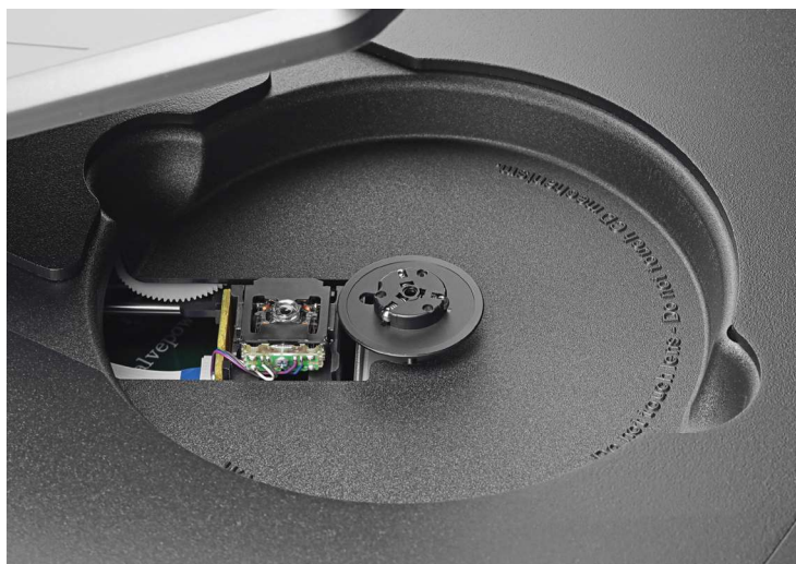
The transport holds a CD in place on the spindle-hub with three spring-loaded clips. Also seen here is the sled holding the upward firing laser that moves from centre outward.