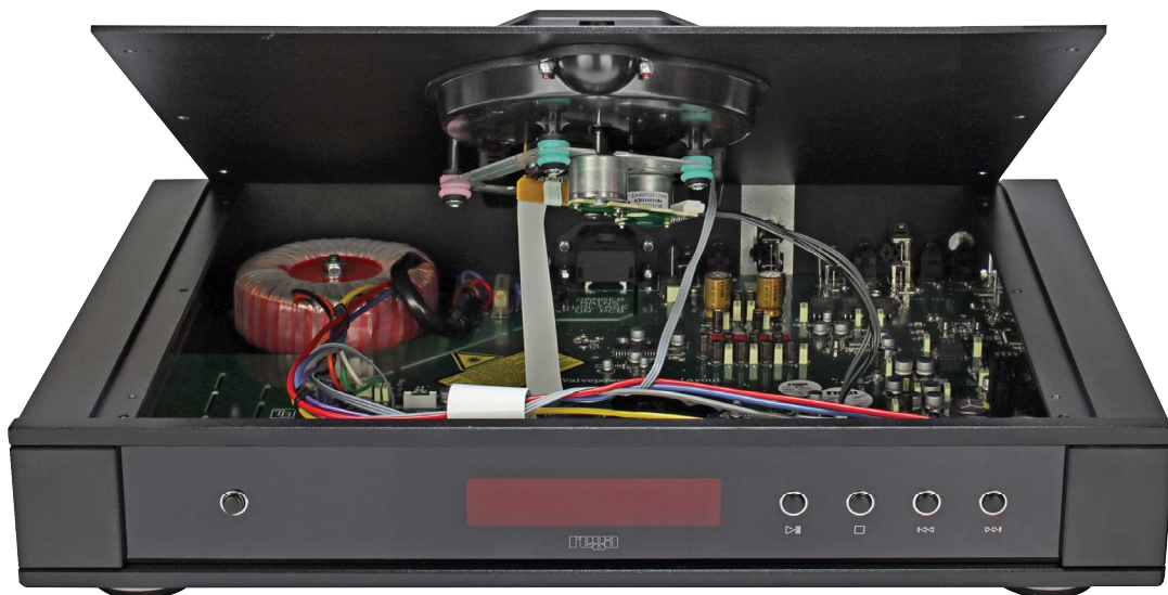
This top loader uses Wolfson WM8472 digital converter (DAC) chips and is driven by a linear power supply fed by a toroidal transformer (left rear).

high-stability master clock, high-performance PLL digital interface receiver, isolated digital inputs, while the signal path of the CD player in CD mode is kept to a minimum.