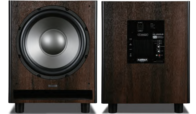
15" Subwoofer 400W Amplifier