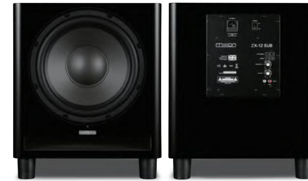
12" Subwoofer 300W Amplifier