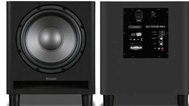
12" Subwoofer 300W Amplifier