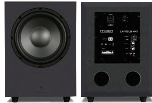
10" Subwoofer 200W Amplifier